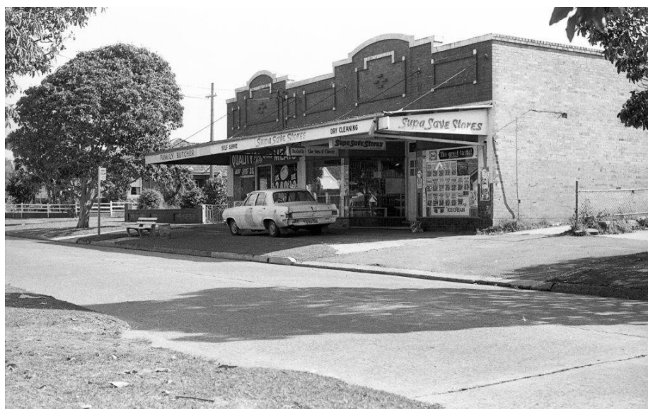
The shops in Sydney Street are now occupied by a large veterinary clinic. In 1978 they served their original purpose as neighbourhood shops.