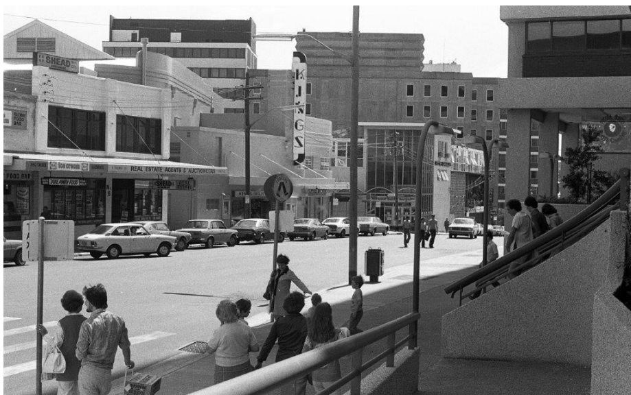
Railway Street from Chatswood railway station with Kings Theatre and the Hotel Charles in the background.

A small selection of the images are reproduced here. We are planning a display featuring Martin's images.