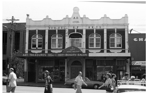
The former School of Arts building in Victoria Avenue, Chatswood in 1978.