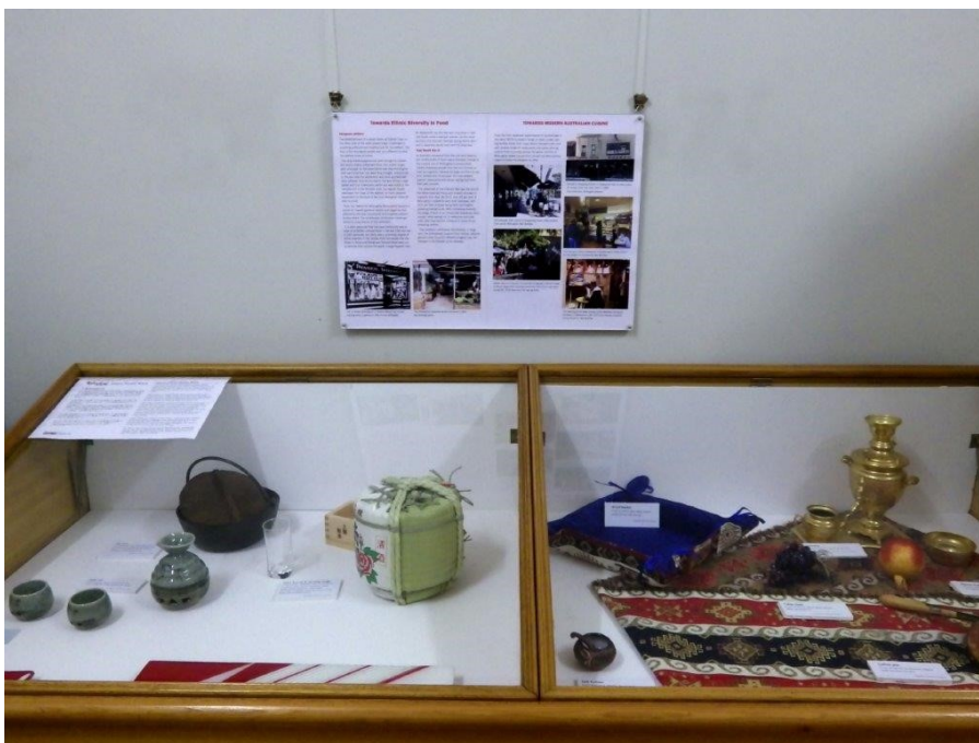
A section of the display of tools, artefacts and photographs pertaining to the Chinese market gardens in Willoughby (top), and the Japanese and Armenian items for preparing and consuming food (below).