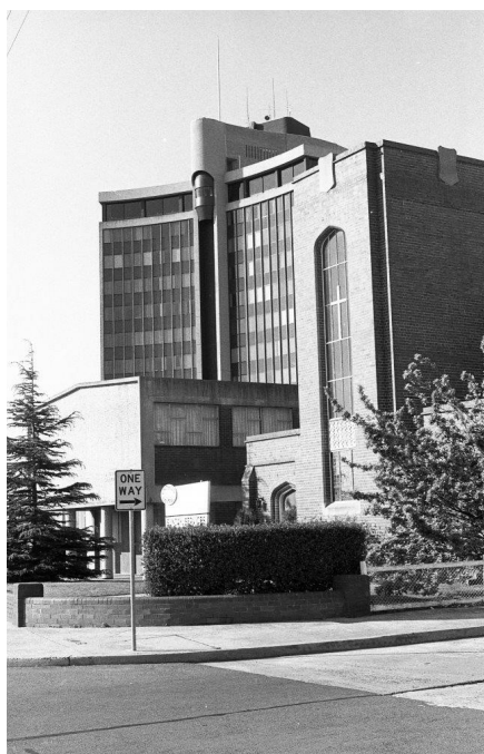
The office building at 615 Pacific Highway in 1978.