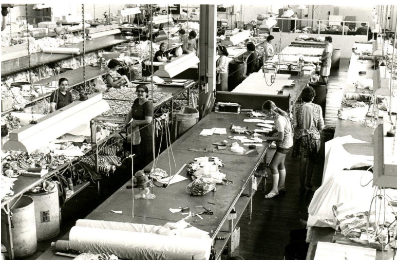
LEFT: An overview of the cutting floor at the Speedo factory in Artarmon. The workers, predominantly women, laid out the fabrics on the long tables and then used electric cutting machines to cut out the patterns.