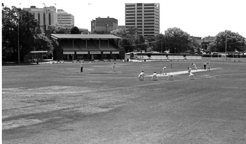
RIGHT: A grade cricket match on Chatswood Oval.