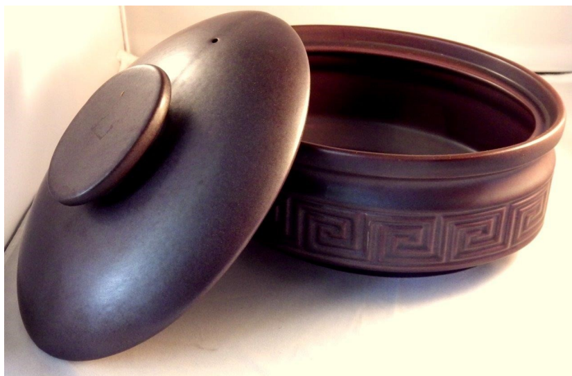
Doulton Australia Grecian Key brown casserole dish made in Chatswood.

A selection of objects from our collection are presented here.