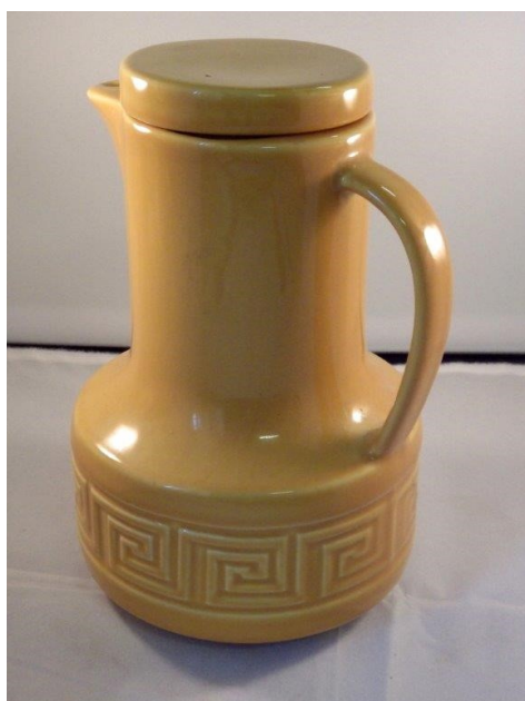
ABOVE: Doulton Australia Grecian Key coffee jug made in Chatswood.