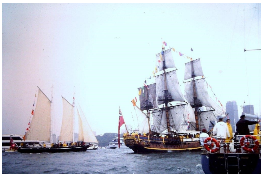
Harbour congestion from Howard Rubie's yacht, Australia Day 1997. Bob McKillop