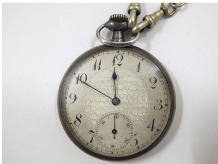
RIGHT: An Elgen pocket-watch with Fob and Chain.