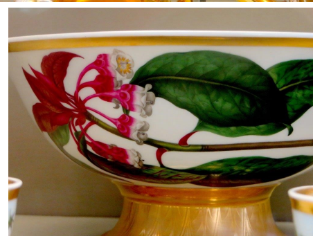
Above: The serving tray featuring Australian wildflowers, and below a bowl with a Kurrajong flower. Paul Storm