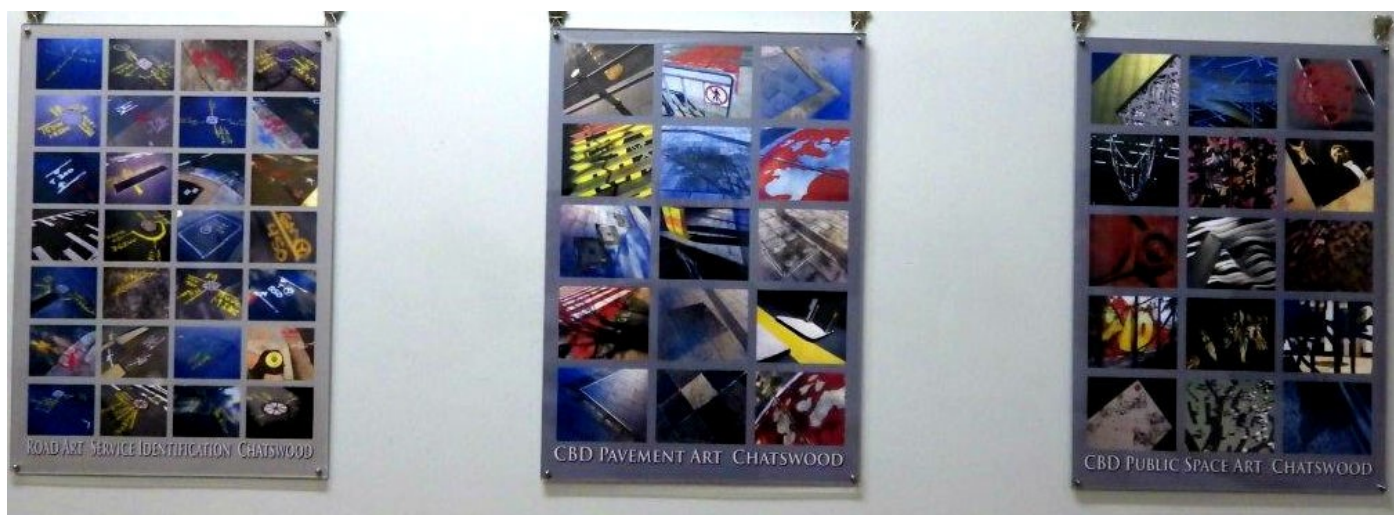
BELOW: City Surface public art panels in the City Surface Genesis exhibition.