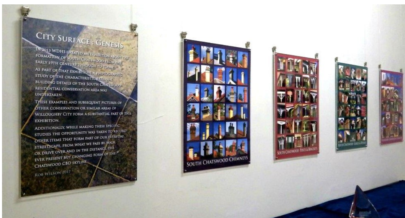
ABOVE: The entry panels to the City Surface Genesis Exhibition at the Willoughby Museum.

There has been a range of visitors since the opening of the exhibition on 10 September and many of them have been particularly enthusiastic about their experience. The exhibition will remain open on Sunday afternoons until Sunday 3 December, when we hold our annual Christmas function for members and friends. We will retain this exhibition in the New Year, when the Museum will reopen on 29 January 2018.