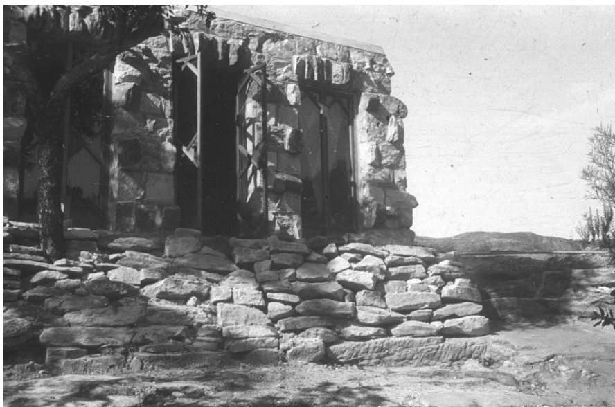
A close-up view of the Walter Burley Griffin designed clubhouse at the Castle Cove Country Club golf course circa 1933. Sadly, the clubhouse and all its contents were lost in a fire in July 1957.