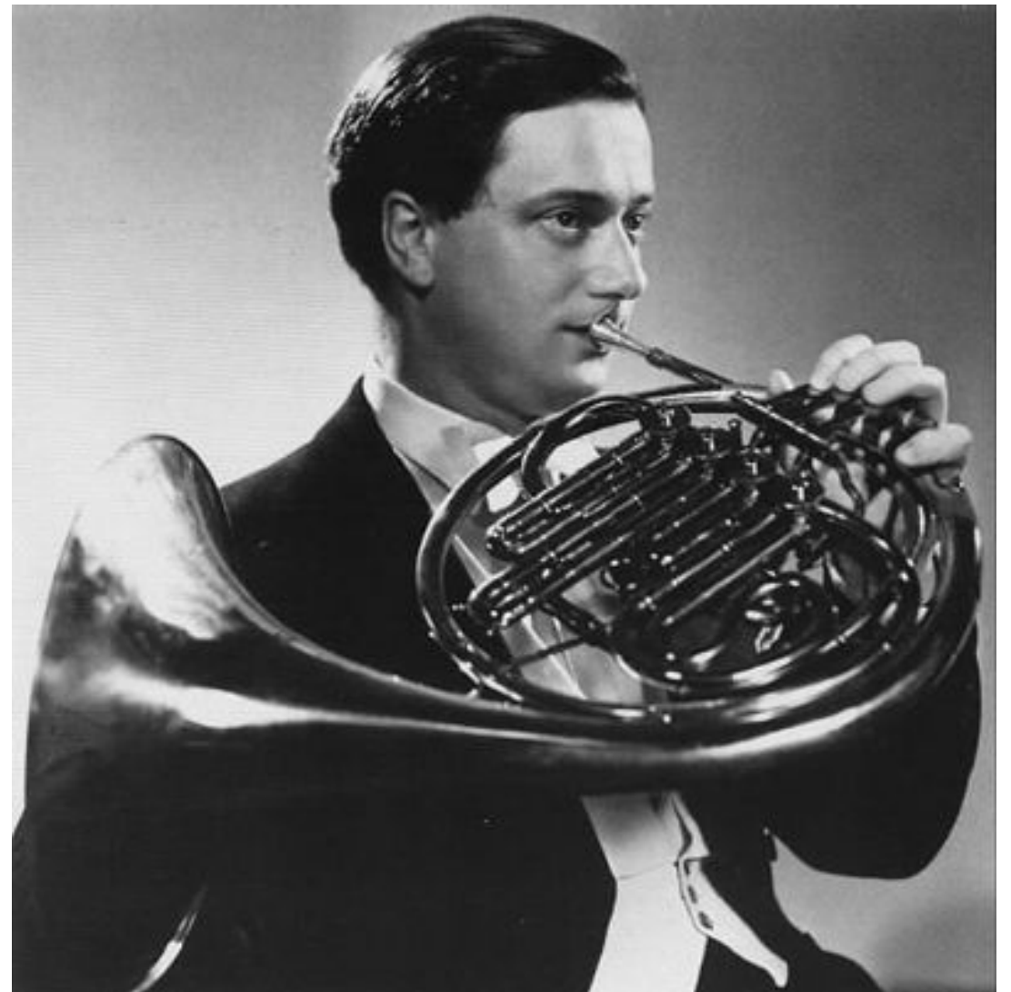
Barry Tuckwell with his French Horn

BARRY TUCKWELL , child prodigy, lived in Willoughby. Tuckwell became a chorister at St Andrew's Cathedral, Sydney where he studied the piano, organ, and violin. Then, at the age of 13, he started to learn the French horn. After six months he was playing it professionally. At 15, he was given the job of third horn with the Melbourne Symphony Orchestra. A year later, he joined the Sydney Symphony Orchestra which was conducted by Eugene Goossens .