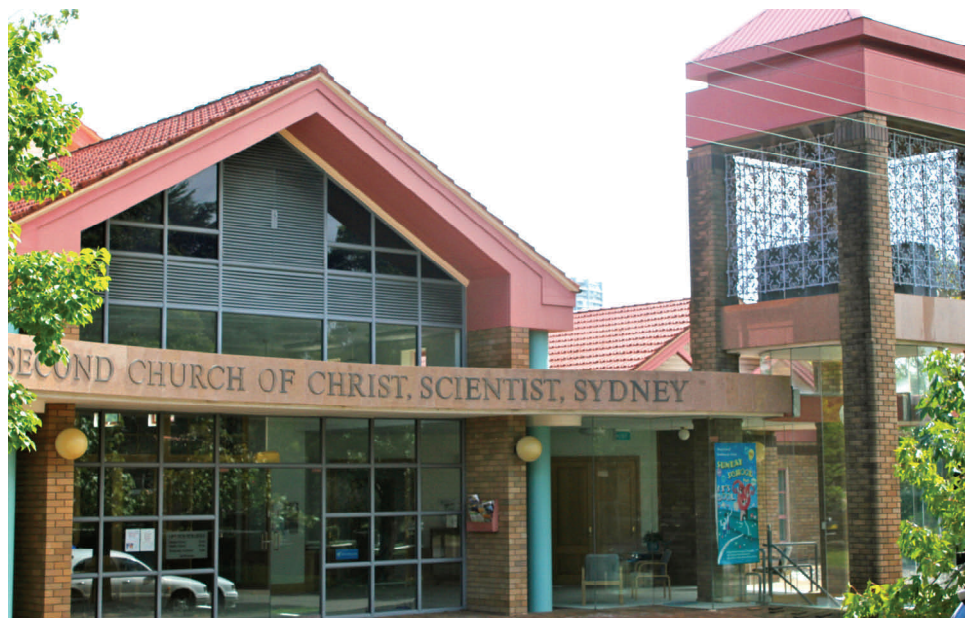
The Second Church of Christ Scientist Church at the corner of Albert Avenue and Nerida Street, Chatswood.